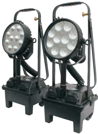
BW3210-2° (Spot) BW3210-60° (Flood)